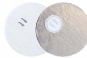
M-Vent 120% More Air Flow